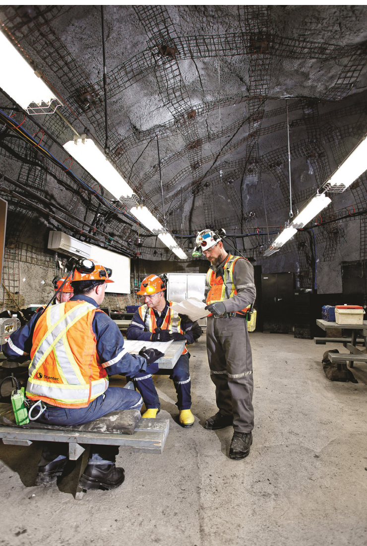
Including facilities for workers in design planning can help create a more inclusive work environment, which in turn can lead to improved efficiency, worker wellbeing and retention and productivity.

Creating a more inclusive work environment: At a remote underground mine in Indonesia, operators would stop work a few times a day to travel to places of worship to fulfil their religious commitments.